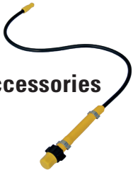
Mini-Flex for DR 5 Art.No. 11947101