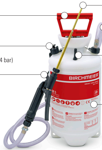
DR 5 Art.No. 11625701